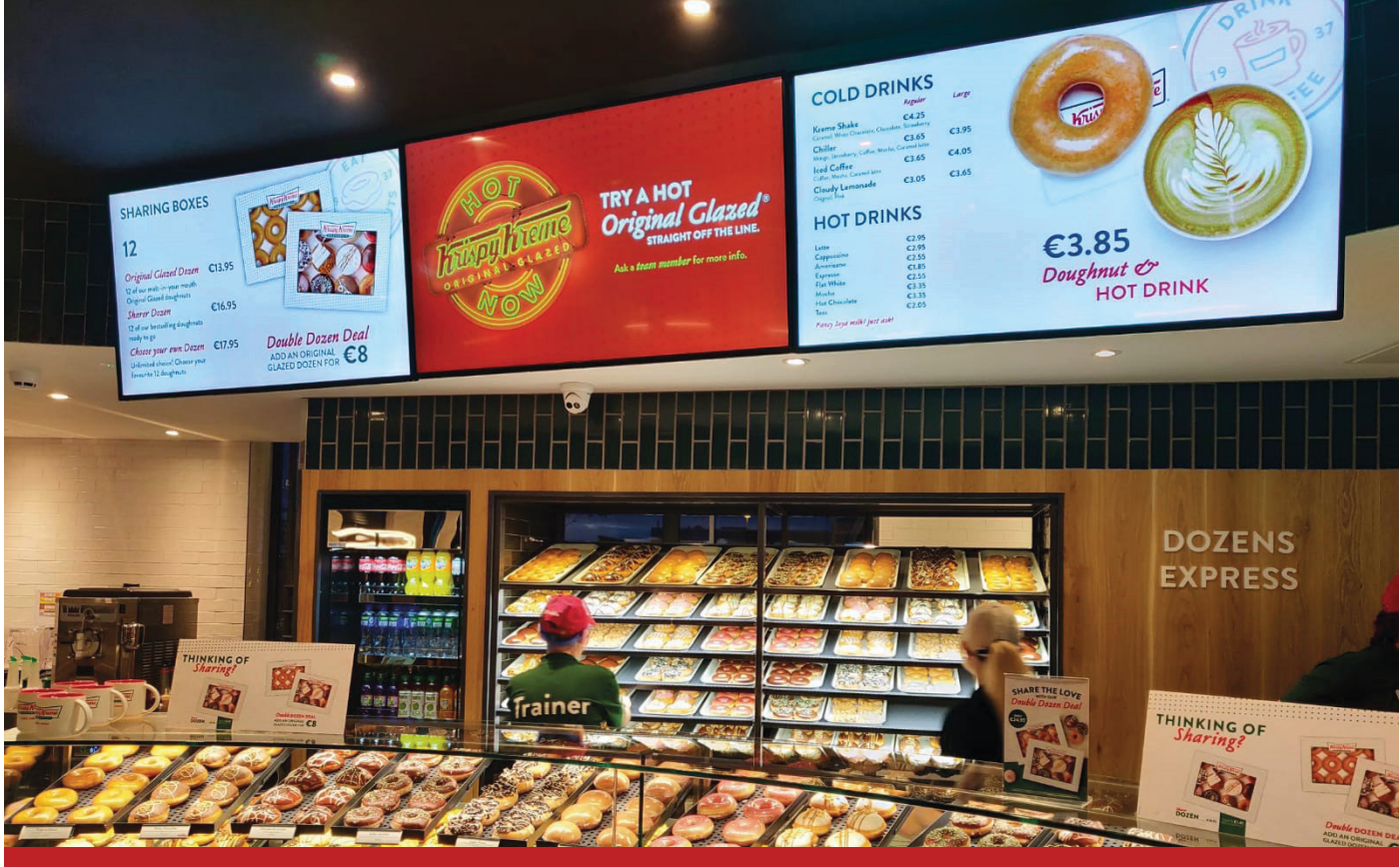
Cost-effective package solution; 24/7 commercial grade displays with built-in network media player and 1 year CMS software subscription